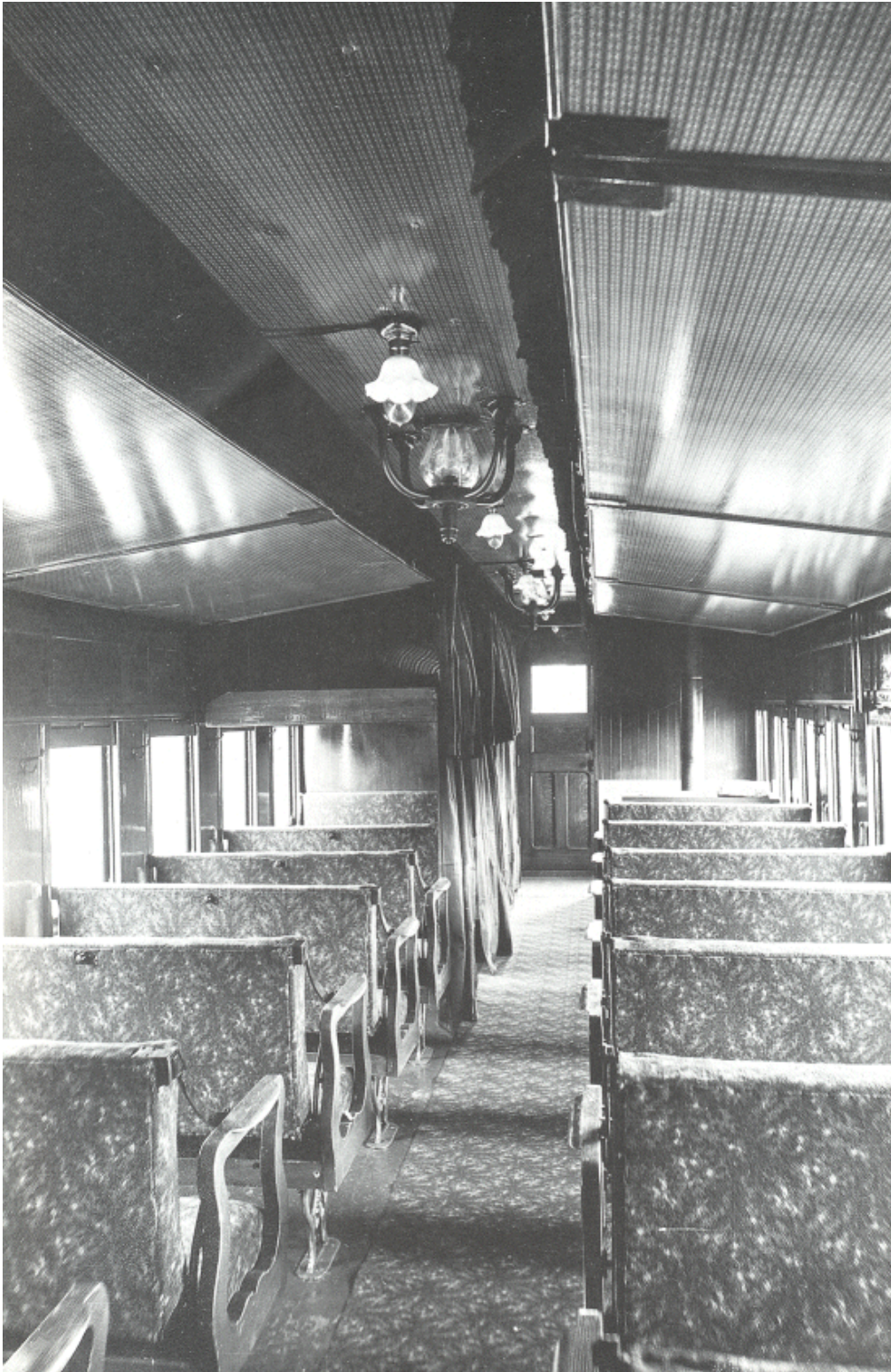
1864 Interior of Pullman's First Sleeping Car